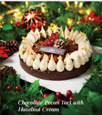
Chocolate Pecan Tart with Hazelnut Cream