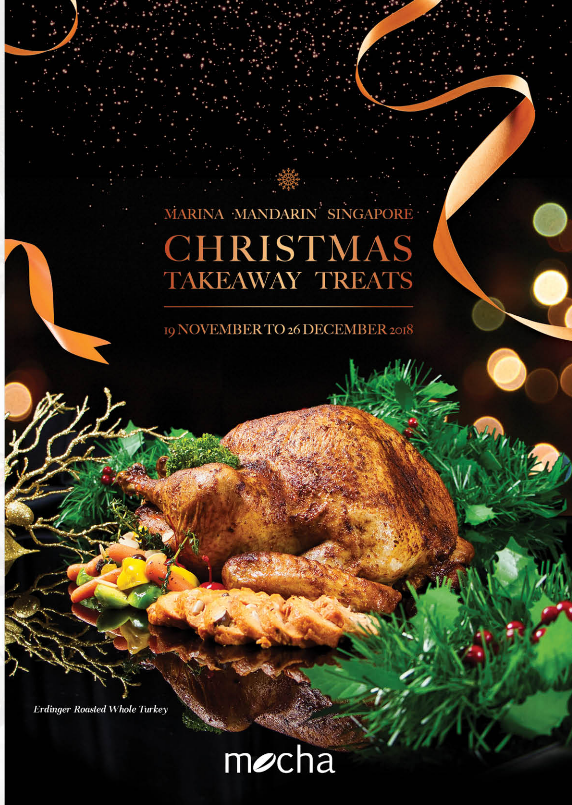
Erdinger Roasted Whole Turkey